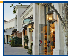
Retail Spaces (Shops)